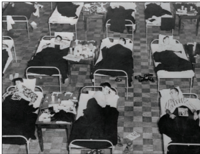
Put to bed. A ballroom was turned into an emergency infirmary at the University of Massachusetts during the 1957 “Asian flu” pandemic.